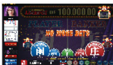
英文界面 English display

This function allows switching between the English and Chinese languages.