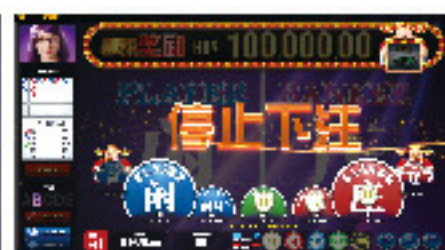
中文界面 Chinese display